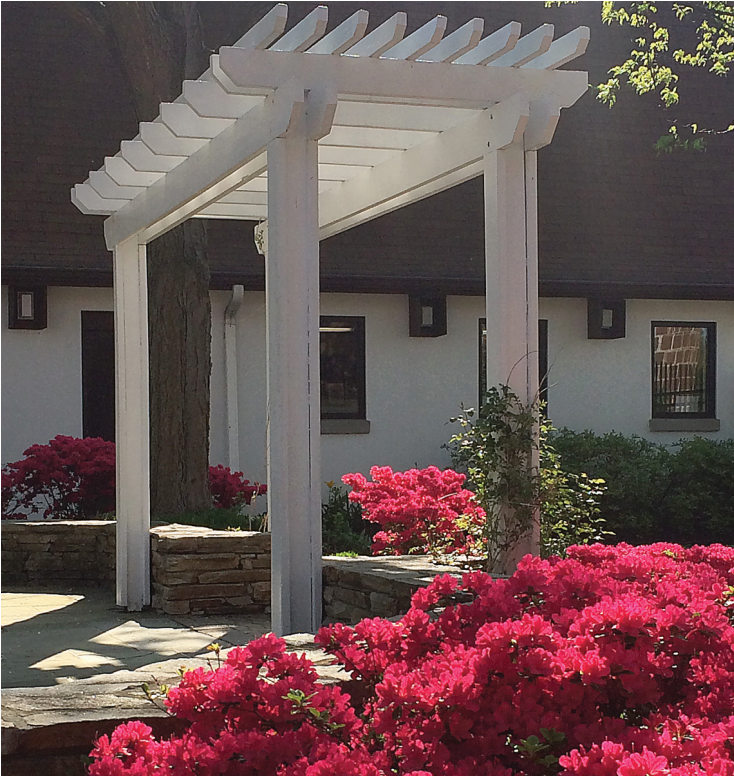
The Other Barn and The Barn are the only original buildings in the Oakland Mills Village Center. Major remodeling of The Other Barn took place in 2008. It is designated to serve as the center of the community.